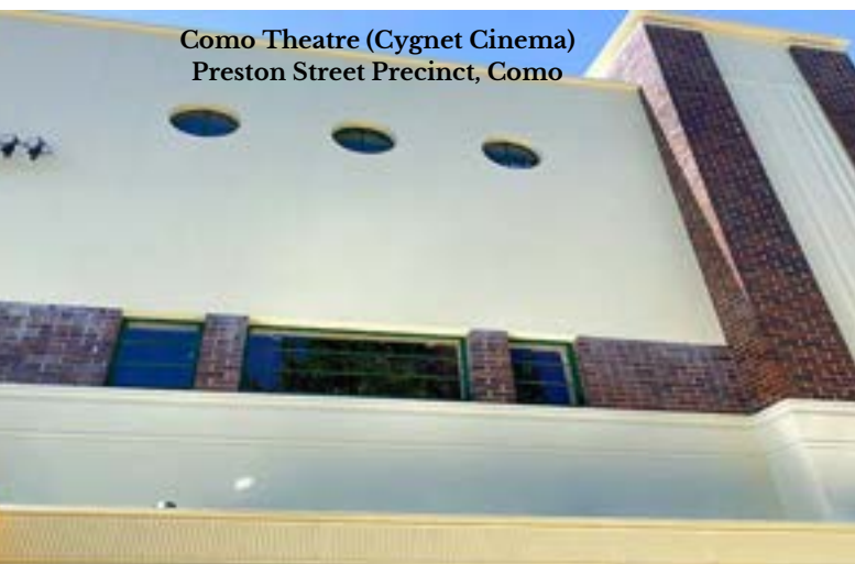
Como Theatre (Cygnet Cinema) Preston Street Precinct, Como