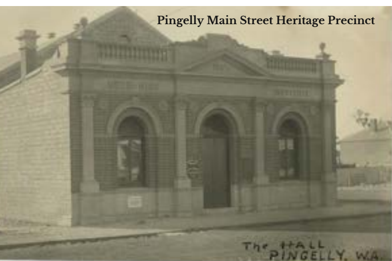
Pingelly Main Street Heritage Precinct