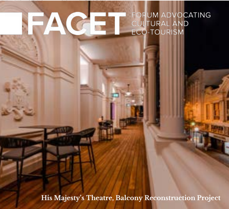
His Majesty's Theatre, Balcony Reconstruction Project