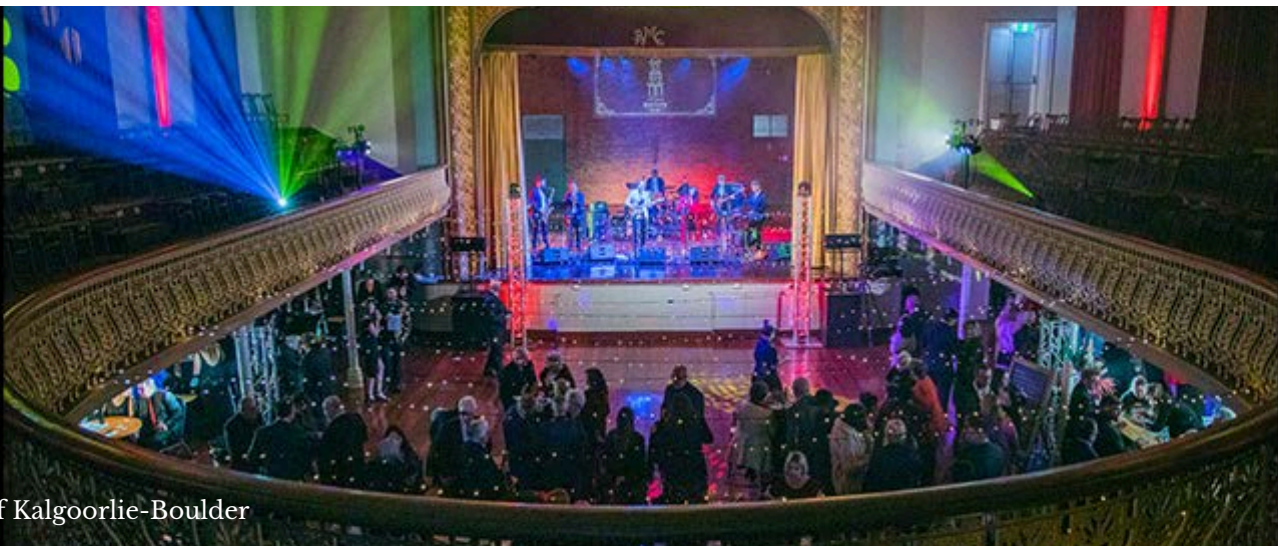
City of Kalgoorlie-Boulder

Celebrating Western Australia's unique cultural heritage